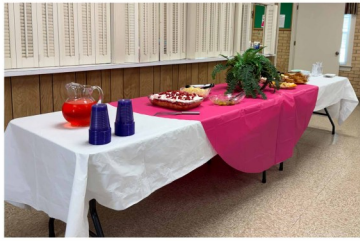
Hosted by the Coordinating Team