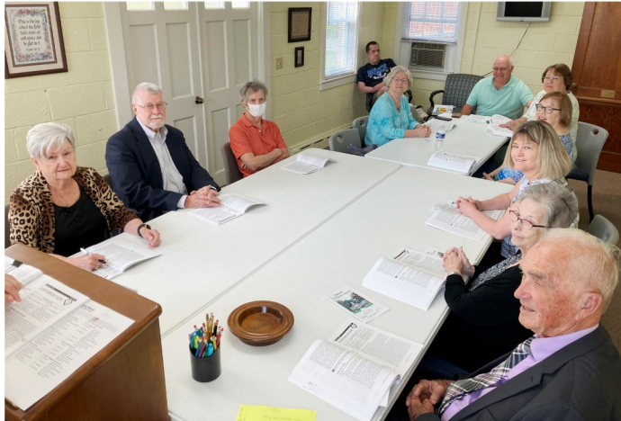
Mary Olive Smith Sunday School Class