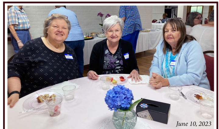
June 10, 2023