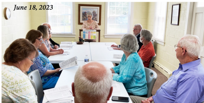
June 18, 2023