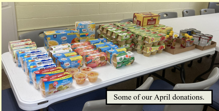
Some of our April donations.

The members at Edgewood are incredible! We asked you to donate fruit cups and apple sauce in April for the CUOC Backpack Pals program. You responded with over 320 items! These, along with other donations from our church totaled 119 pounds of food for the month! Thank you for your help in feeding our neighbors in Lee County who need help.