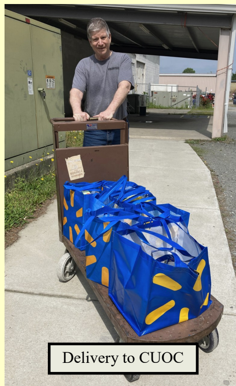
Delivery to CUOC