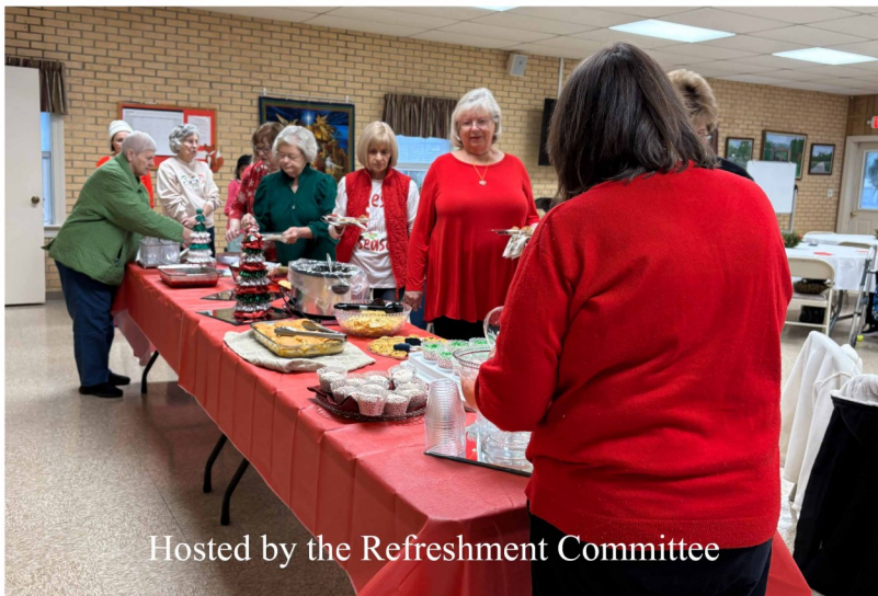
Hosted by the Refreshment Committee