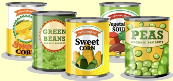
Steve Womack: Chair

We are collecting canned vegetables in January for CUOC. It can be green beans, corn, carrots, potatoes, peas, spinach, mushrooms, etc.