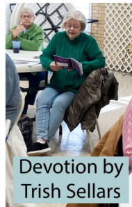
Devotion by Trish Sellars