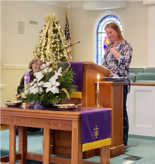
An emotional/heartfelt introduction