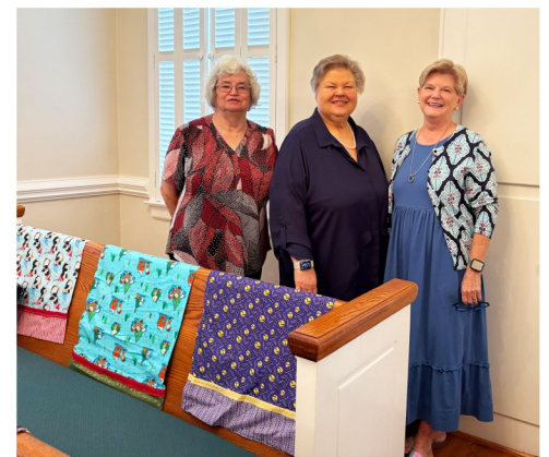
Some of the Piece-Makers