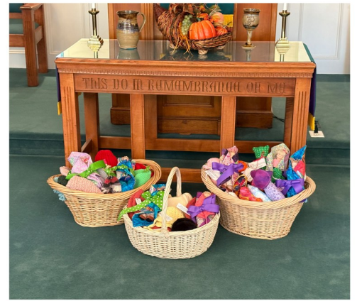
Stuffed animals and knitted hats made by the Edgewood Piece-Makers and other church members will be donated to children's hospitals in Charlotte and Greenville, NC and to Lee County CUOC.