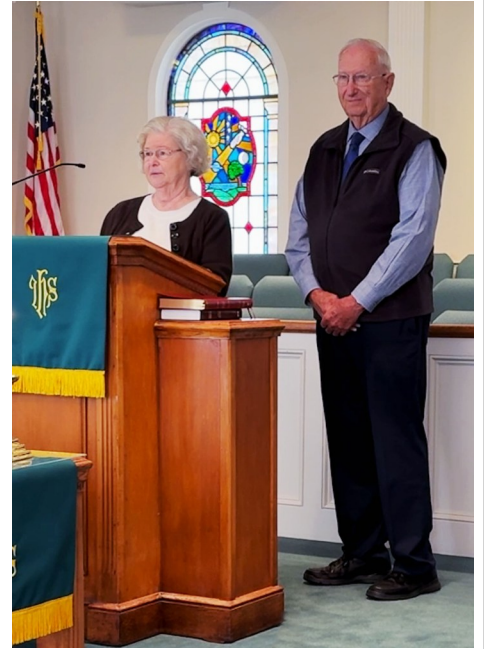
The Sellars Family