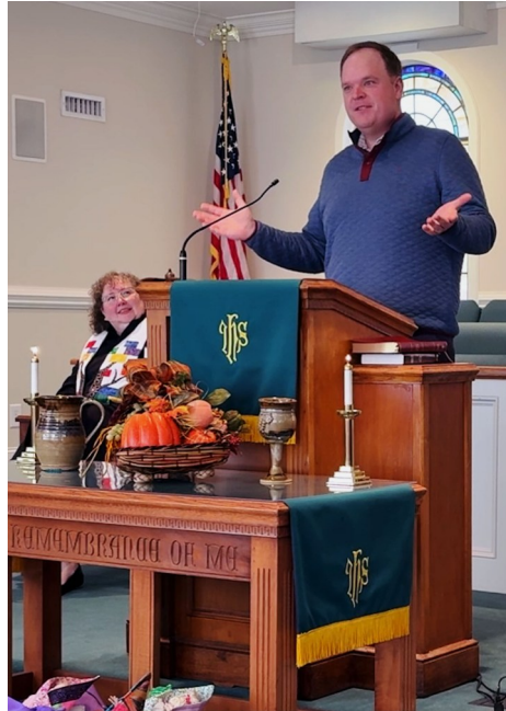
The Wester Family