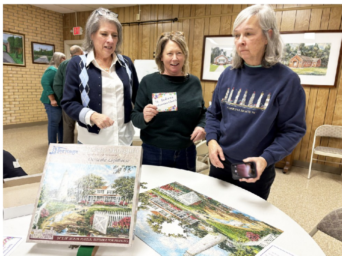
Winners - St. Andrews Presbyterian Church