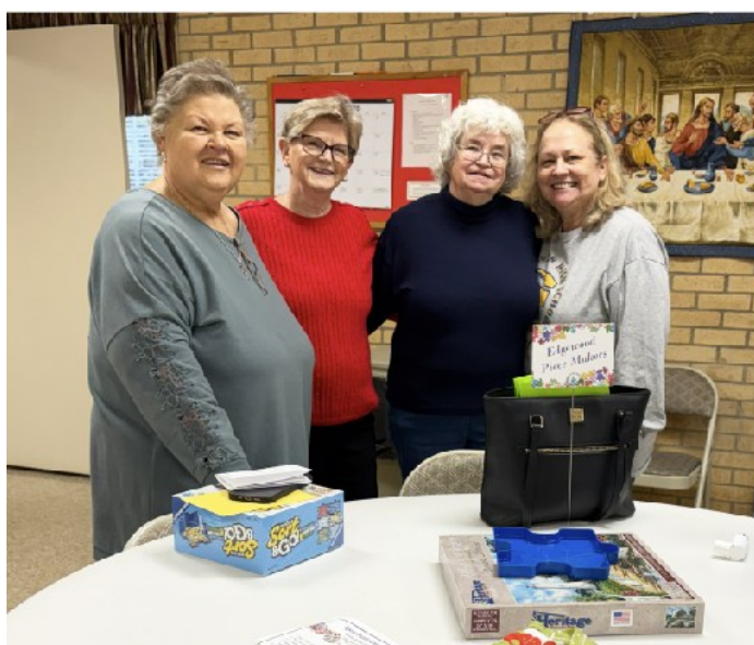
2nd Place—Edgewood PieceMakers