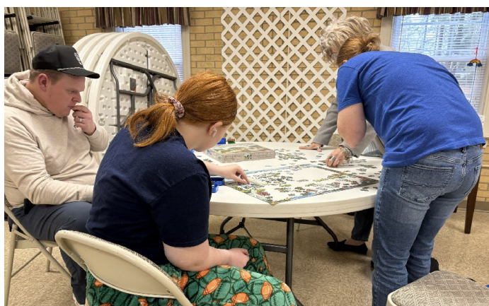
3rd Place - The Puzzled Puzzlers