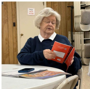
Devotion by Trish Sellars