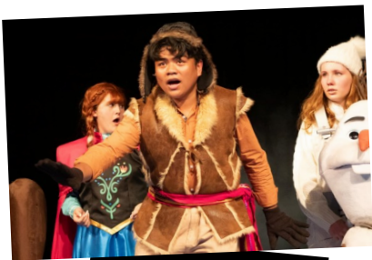
Some memories they leave with us!