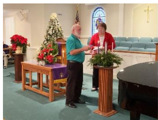
Lighting of Advent Candles

To everyone celebrating January Birthdays!