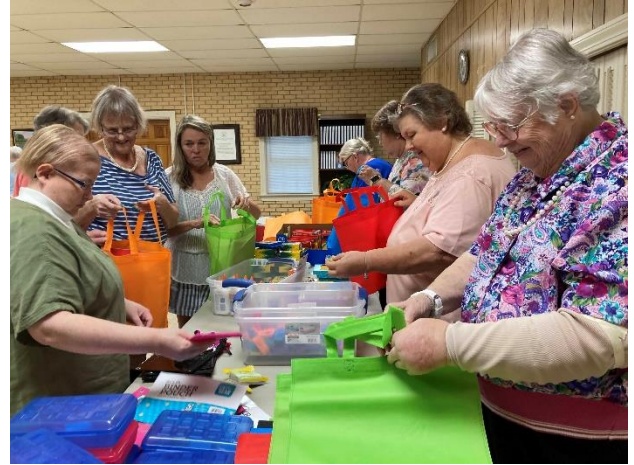
The women enjoyed assembling the school supplies donated by the congregation.