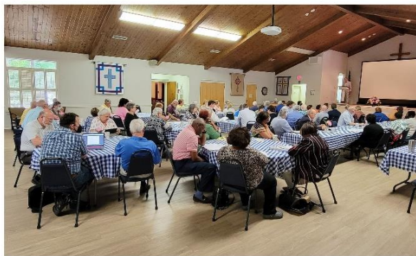
The West Community of the Coastal Carolina gathering was held at Pocket Presbyterian Saturday. They had discussions addressing post-pandemic attendance.