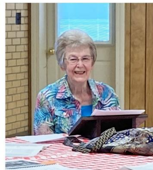
PW Meeting June 13, 2022