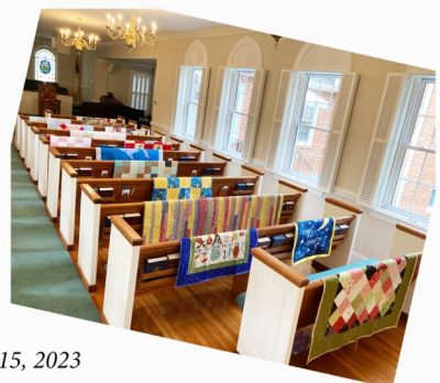
October 15, 2023