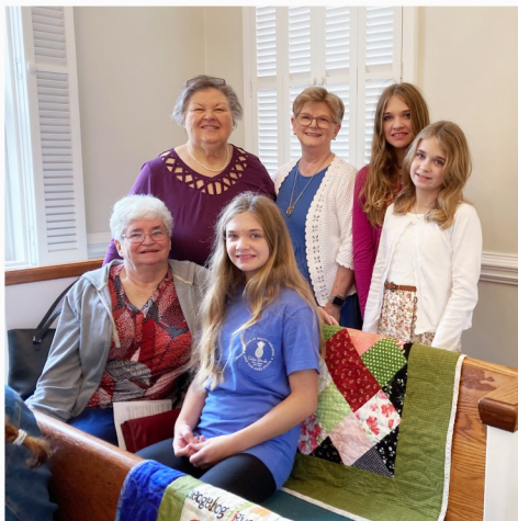
Some of the quilters who contributed to this project.

No value can be placed on the comfort that these quilts bring to the young patients who are wrapped in the love and concern that went into every piece of cloth, every cut, and every stitch.