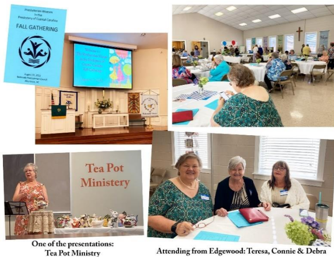
One of the presentations: Tea Pot Ministry