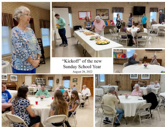
"Kickoff" of the new Sunday School Year August 28, 2022