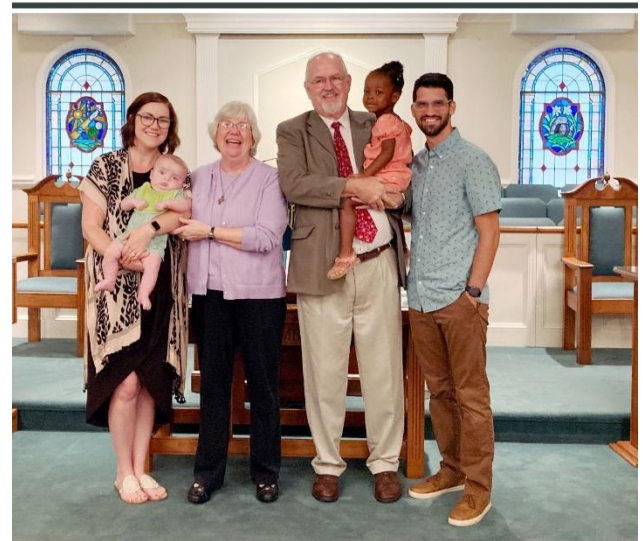
Let Retirement Begin!